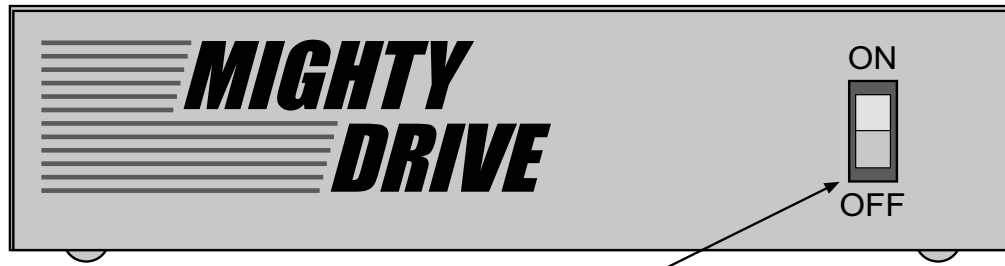
MAIN POWER SWITCH