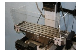
Optional Splash Guard